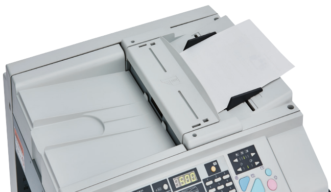
Automatic Document Feeder