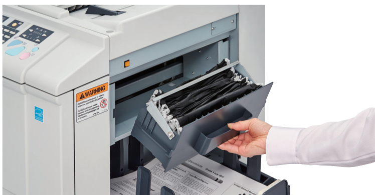
Used Master Box